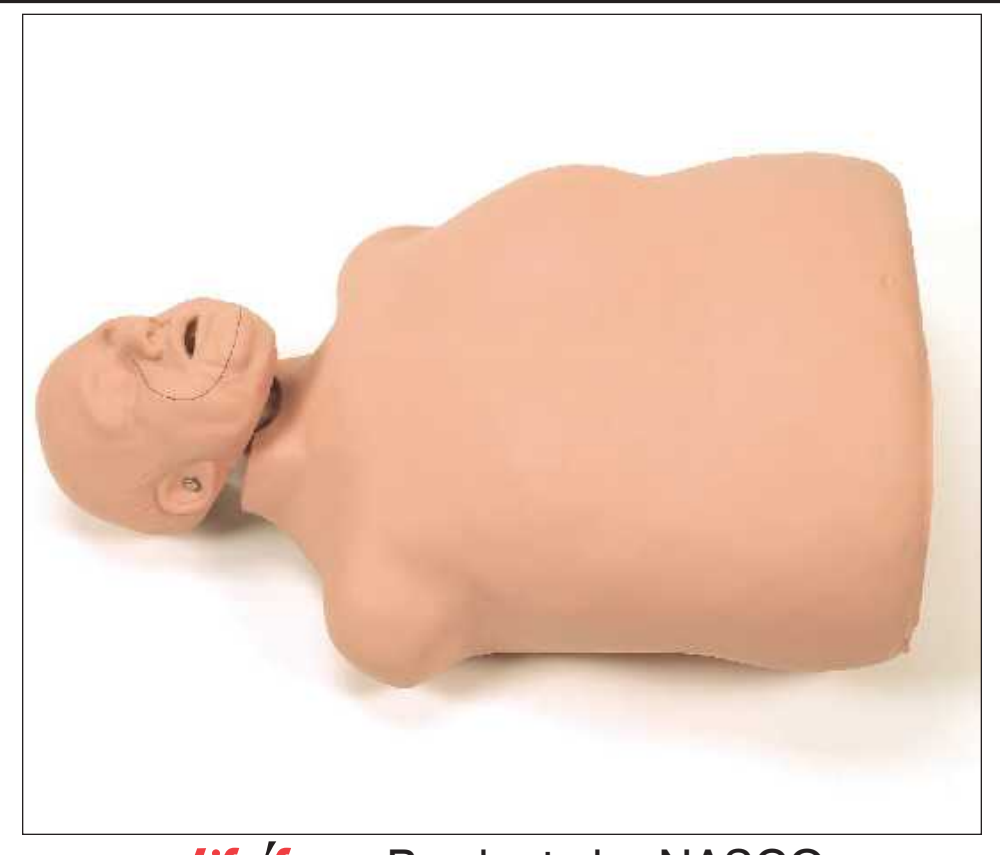
Life/form Products by NASCO